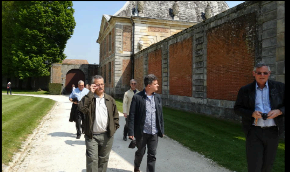
May, 7th - Arriving to Vaux-le-Vicomte Castle