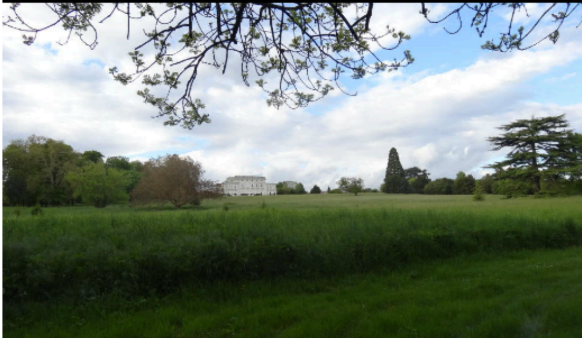
May, 8th Dinner at home