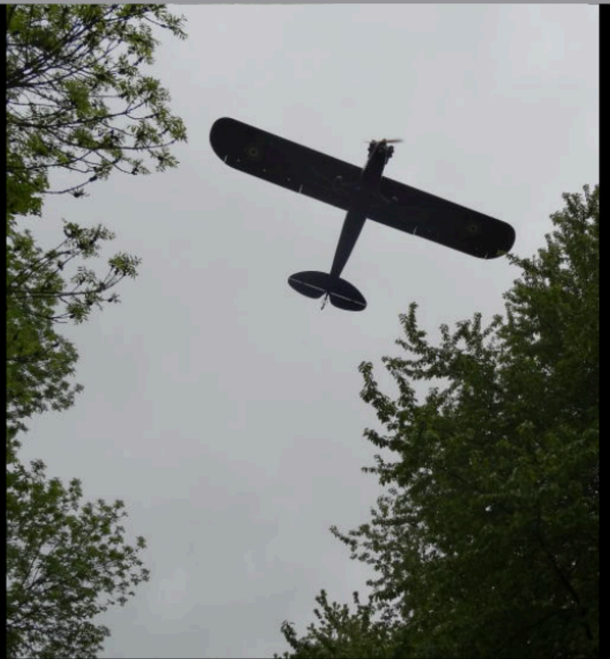
An old Pippercup fly over the ceremony and throw a blue, white and red bunch of flowers