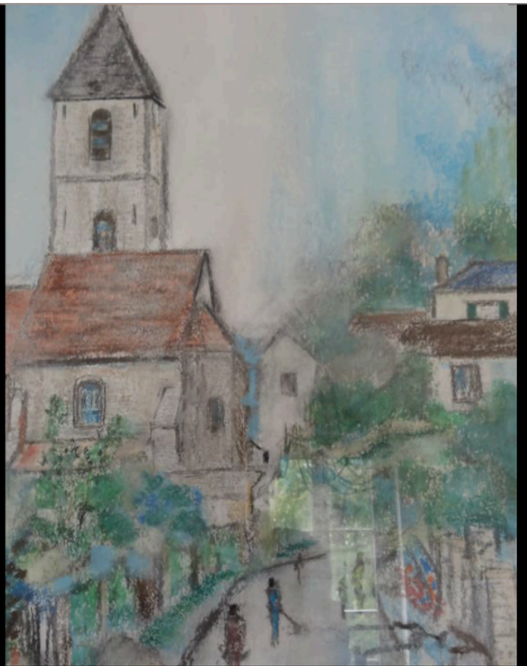
Echarcon City Hall Drawing of Echarcon Church