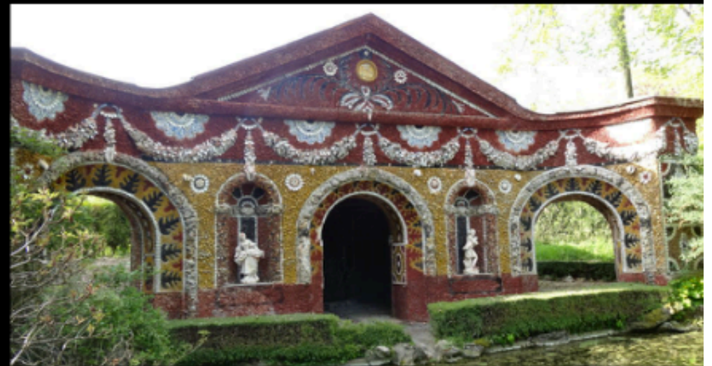
Echarcon, 22 miles south of Paris Its City Hall, 12th century Church Castle and Nymphaea grotto (around 1700)