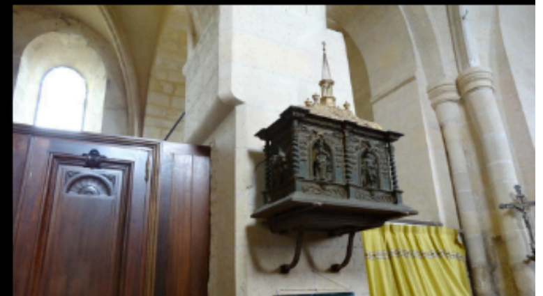
May, 9th - Echarcon Church and its precious reliquary