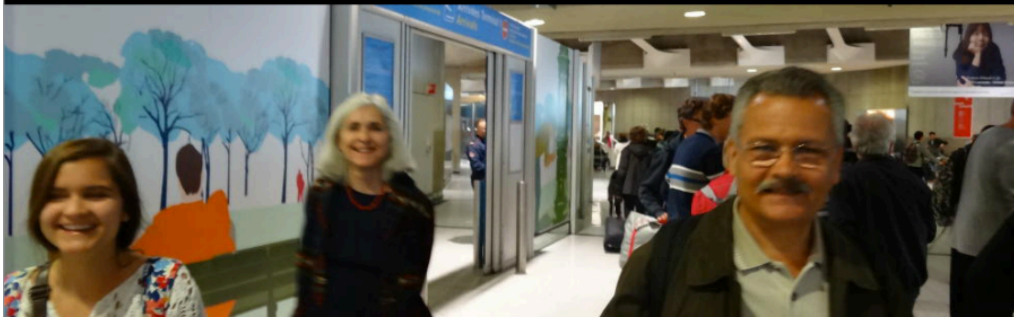
May, 7th 2013, 8.02 am , arriving at Roissy Charles de Gaulle Airport