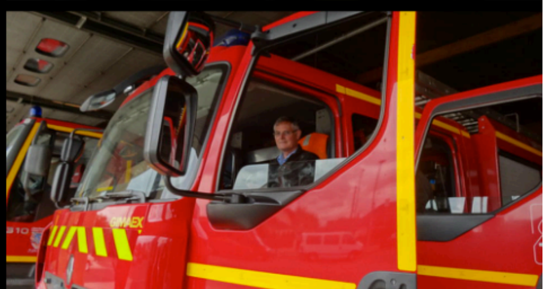
New members of Savigny firestation !