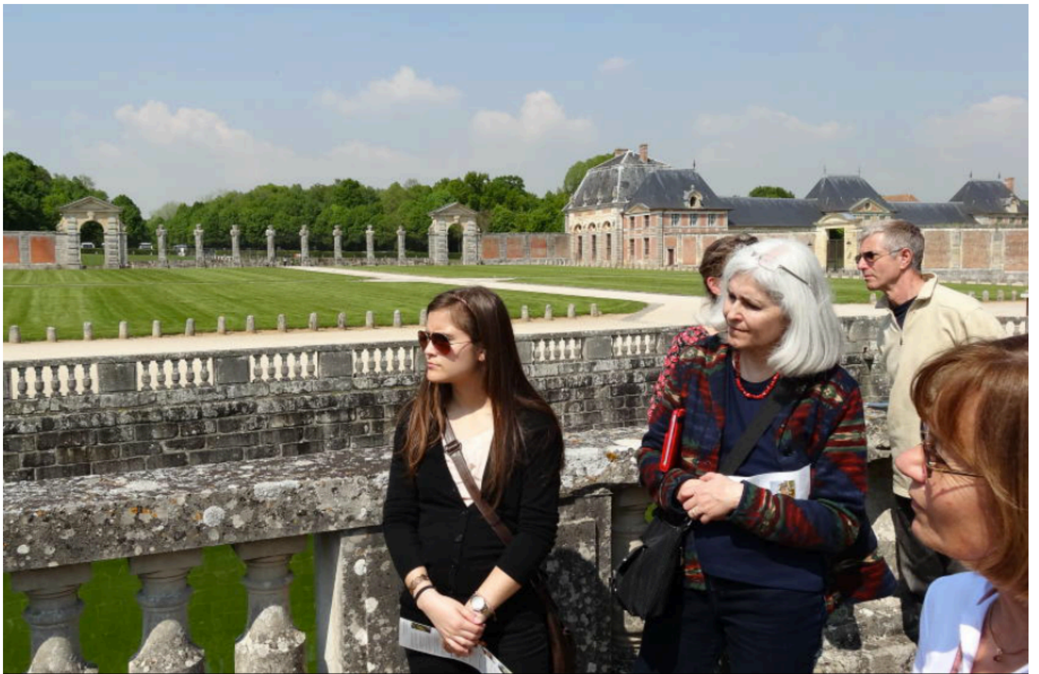
Vaux-le-Vicomte (1656 - 1661)