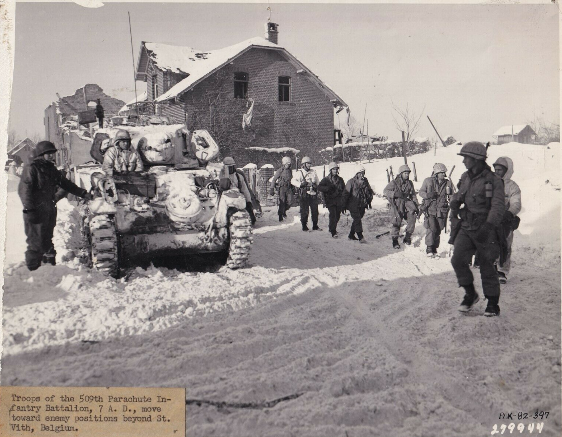
Troops of the 59th Parachute Infantry Battalion, 7 A. D., move toward enemy positions beyond St. Vith, Belgium.