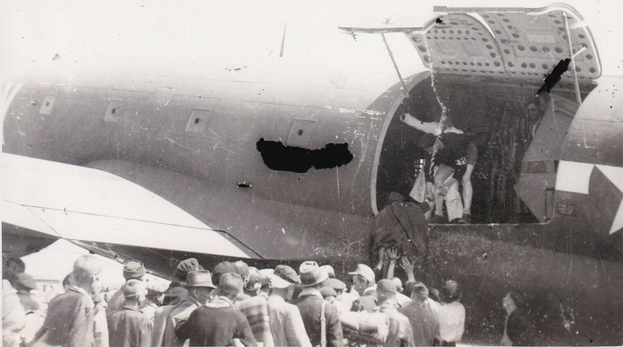
French men - Going Home by C-47s