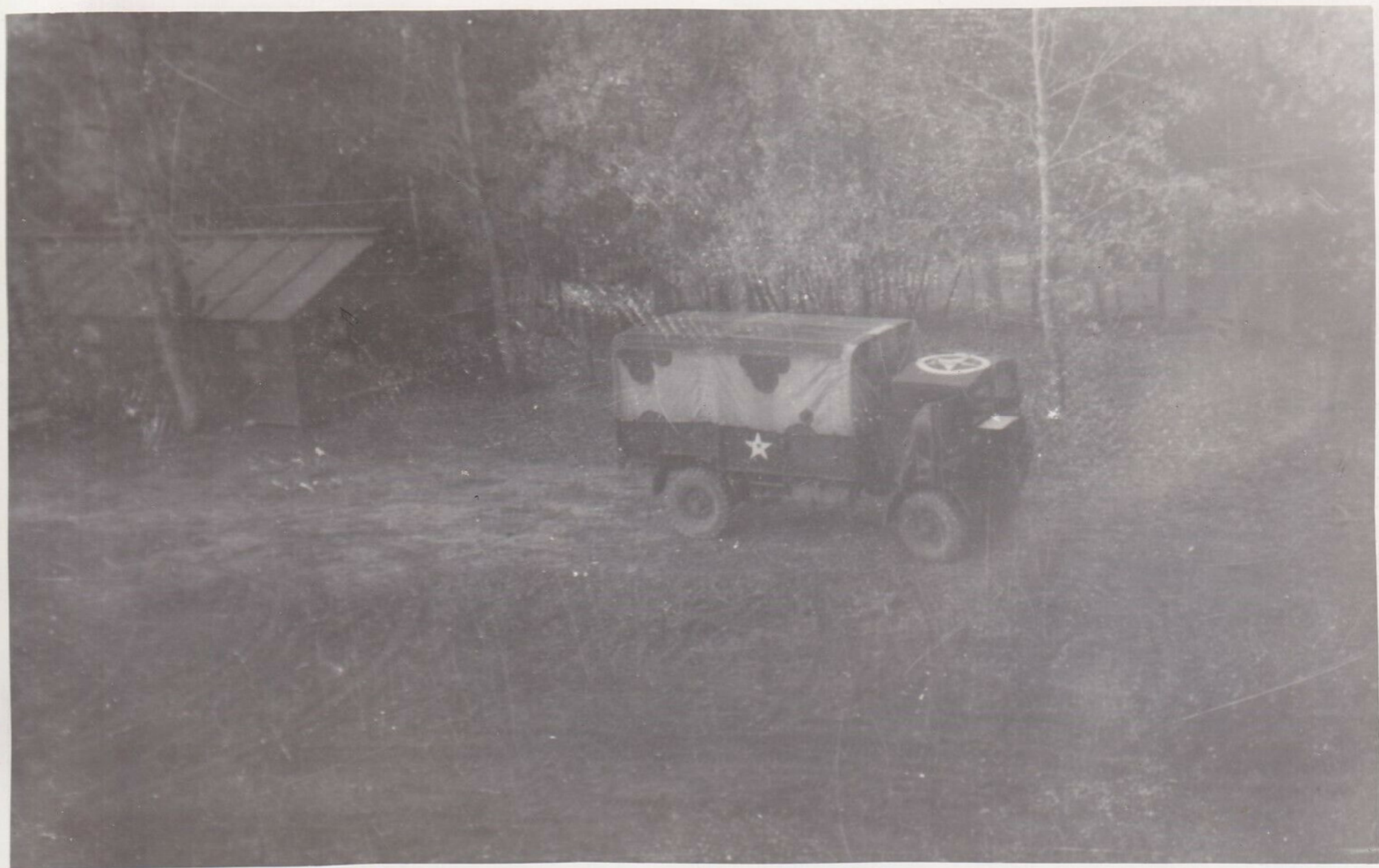
A Lima's Lorry