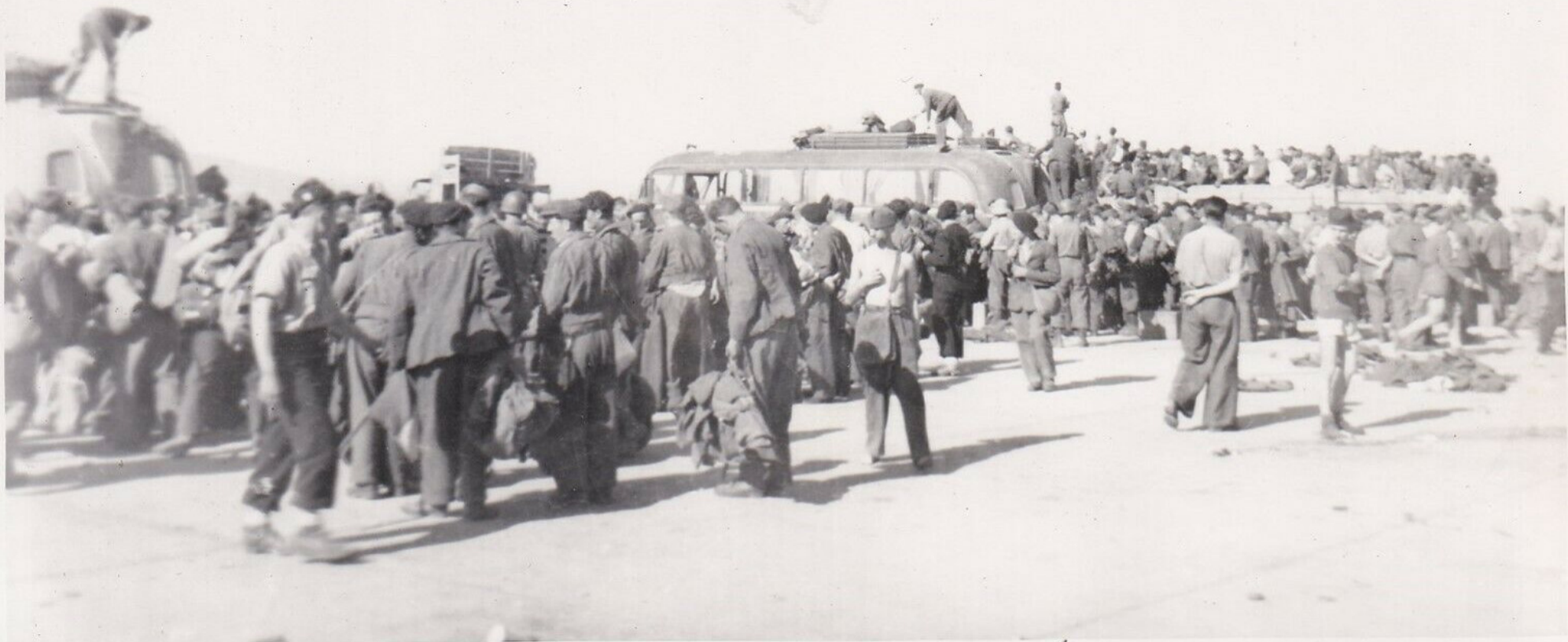
Germans To be screened