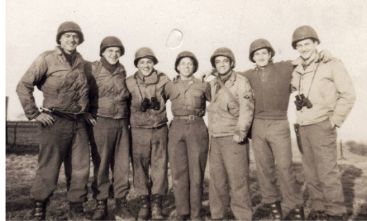
04 "In the pictures of the crew from his M15, he is the one on the right standing with the binoculars. (I still have them)."