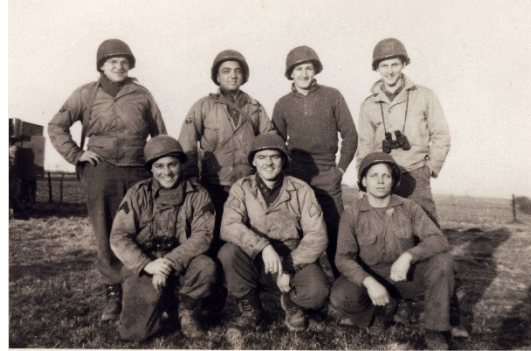
03 "In the pictures of the crew from his M15, he is the one on the right standing with the binoculars. (I still have them)."