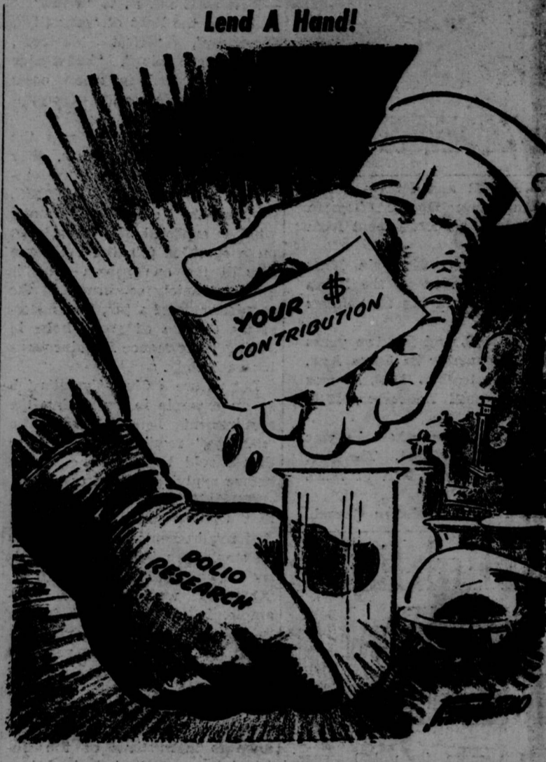
Lend A Hand!