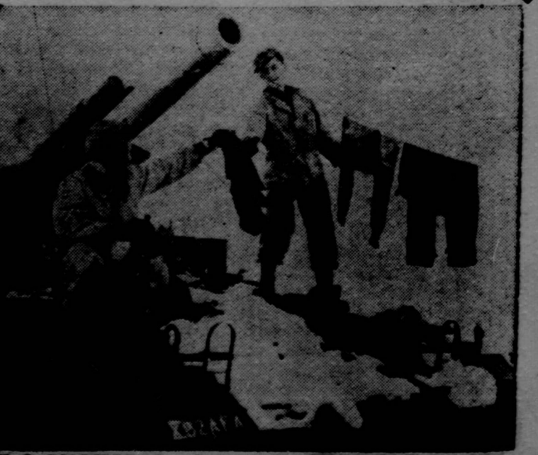
U. S. SOLDIERS take advantage of a hill on the Korean front to catch up with their laundry work. The barrel of their 155 mm. howitzer makes a handy clothes-line pole.