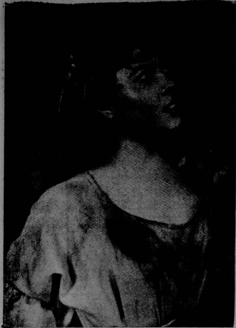
UNHAND ME YOU CAD!—The tasty dish displaying the fiery temperament in Paramount's newest screen sensation, lush Nikki Duval.