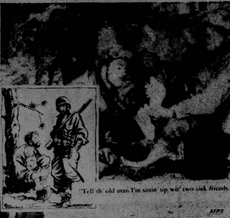
"Tell 'ol old man I'm sittin' up wit' two sick friends."

"WILLIE" AND "JOE"—Bill Mauldin's book, "Up Front" has been entertainingly captured on film and is now playing various camps and bases. Here David Wayne as the ever-sager "Joe" looks over the tired dogs of Tom Ewell as "Willie." The cartoon insert shows how details that made the book so popular are followed in the movie.