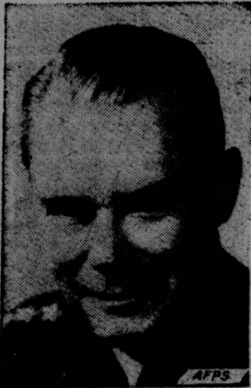
Gen. Hoyt L. Vandenberg, Chief of Staff, U. S. Air Force. Succeeded General Carl Spaatz as Chief of Staff, U. S. Air Force April 30, 1948.

Born January 24, 1899, in Milwaukee, Wis. . . . Was graduated from U. S. Military Academy, June 12, 1923.