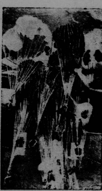
A CLUSTER of more than 49 parachutes of various colors, carrying ammunition to U. N. troops in front battle lines in Korea, present an aerial spectacle as they blossom out behind the open doors of a C-119 Flying Boxcar of the Far East Air Force's 315th Air Division combat cargo.