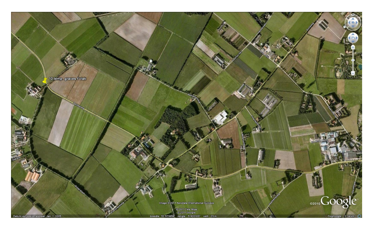
Google earth view with indication of temp. Graveyard.