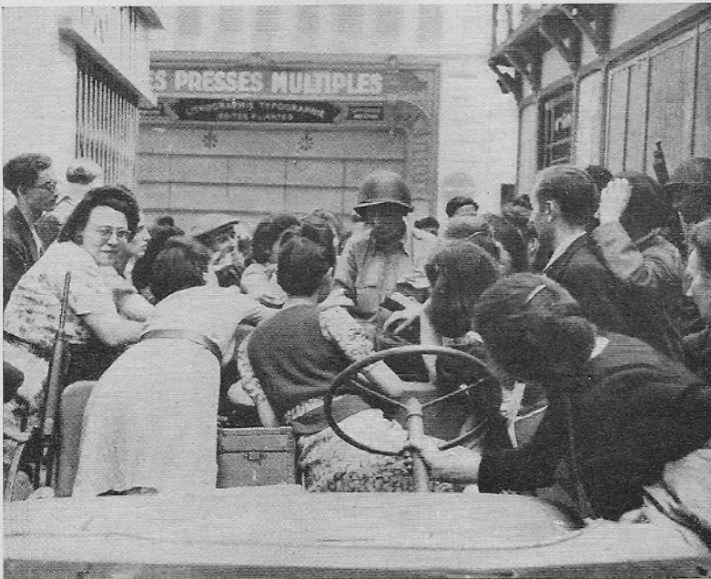
LIBERATED FRENCH AT CHARTRES GAVE ENTHUSIASTIC RECEPTION TO AMERICAN SOLDIERS OF THE 7TH ARMORED DIVISION.