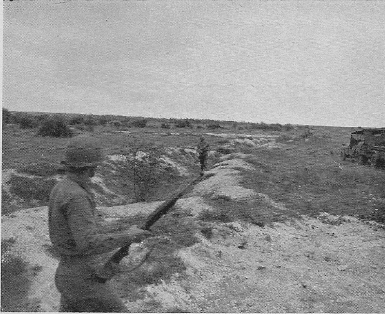
STORIES TOLD THEM BY THEIR FATHERS, VETERANS OF THE LAST WAR, ARE RECALLED BY THESE TANKS AS THEY PATROL TWENTY-FIVE YEAR OLD TRENCH.