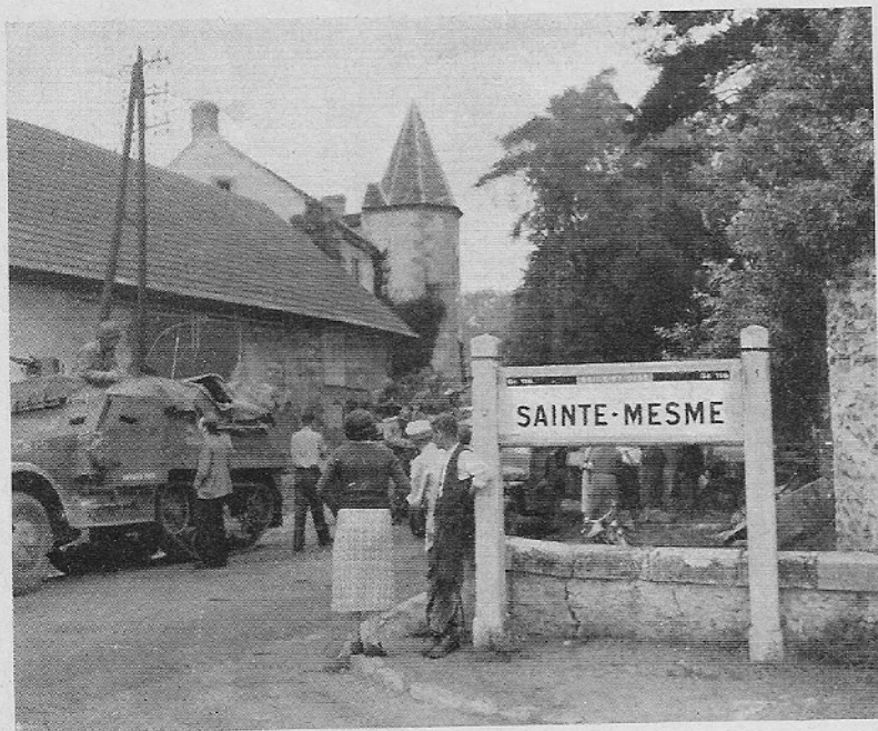
FRENCH CIVILIANS AND MEN OF THE SEVENTH EXCHANGE PLEASANTRIES AND PERHAPS A FEW CIGARETTES.