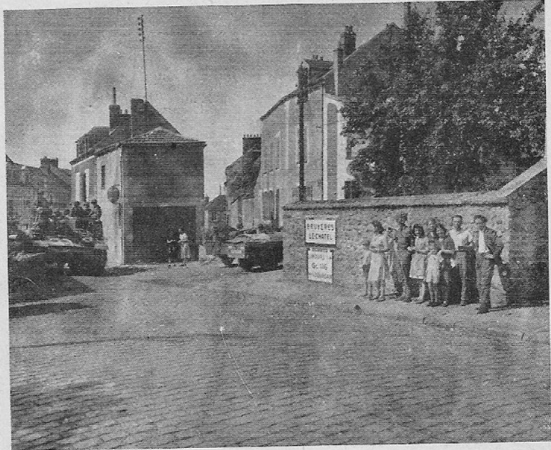
NARROW STREETS IN SOME FRENCH TOWNS PROVIDED TRAFFIC PROBLEM FOR OUR HUGE ARMOR.

9401 - 1011 1015 WALLACE ST BAKERSFIELD, CALIF